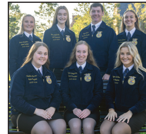
2023-24 State FFA Officers

Thanks to your contributions we are able to directly support 4-H, FFA, Farm Show Jr. Committee & Farm Show Special Operations Team