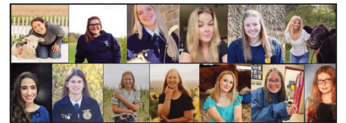
2024 Farm Show Special Operations Team