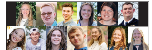
2024 Farm Show Junior Committee